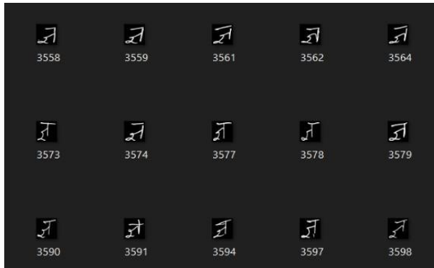
Fig. 1. Devanagari Consonant Dataset (DHCD)