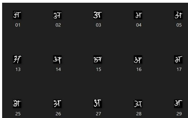
Fig. 4. Devanagari Vowels Mendeley Dataset

Handwritten examples of Devanagari vowels and numerals are included in the data. As a result, the collection contains a total of 23 distinct Devanagari characters (10 numerals and 13 vowels). The vowels were obtained from 1400 participants of various ages, respectively. Data was also separated, pre-processed, and saved in a publicly accessible place. Since the DHCD already contained consonants and numerals, only the vowels from this dataset were used to train and test the model. After eliminating the occluded pictures and scribbles, and the numerals, the final data collection comprises 16,250 digitized images of vowels (1250 each). This data was manually divided into folders and was also made available in CSV format, with labels attached. Each image in this dataset has a black background with white character. [6]