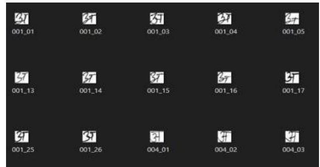
Fig. 3. Devanagari Vowels Dataset (NHCD)